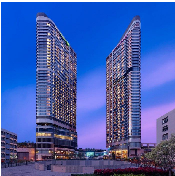
Crowne Plaza, Hong Kong Kowloon East

There are a variety of options for accommodation in Hong Kong, from upscale hotels to cosy B&B. Some recommended hotels are as follows.