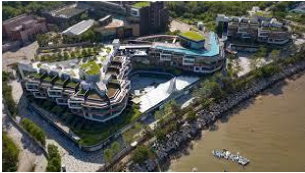
WM Hotel, Sai Kung